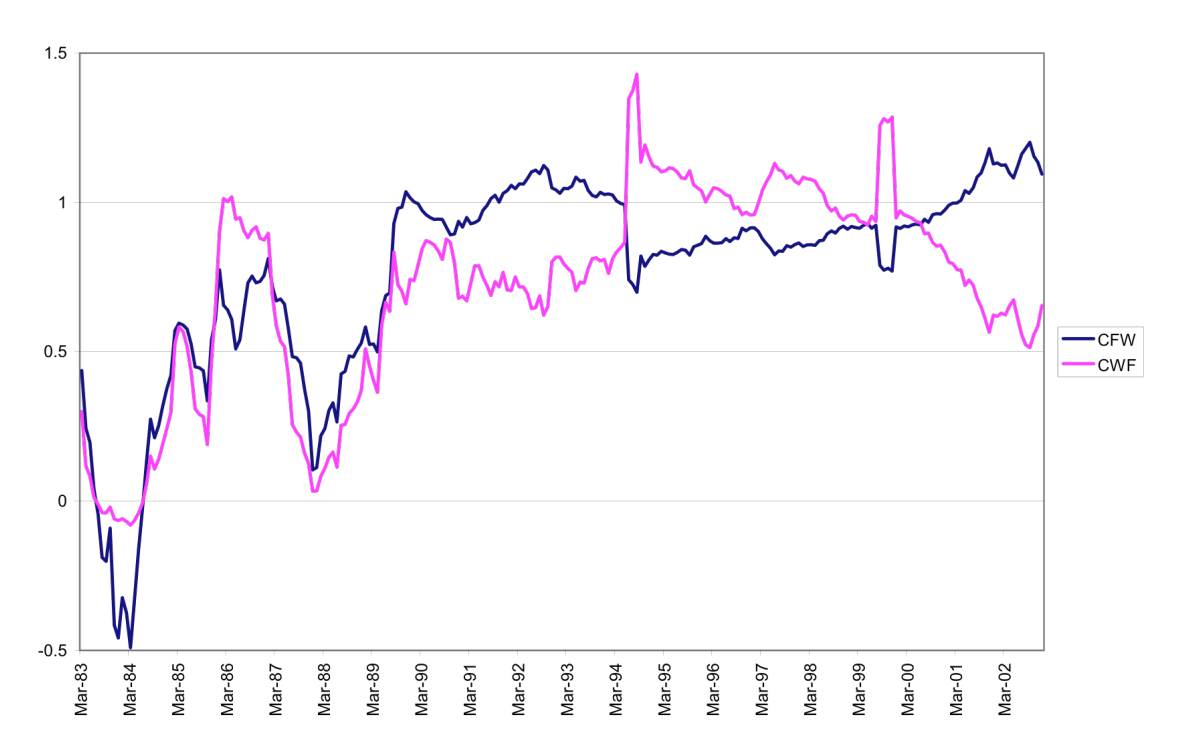
Appendix 3 – Price transfer coefficient: farm versus wholesale prices